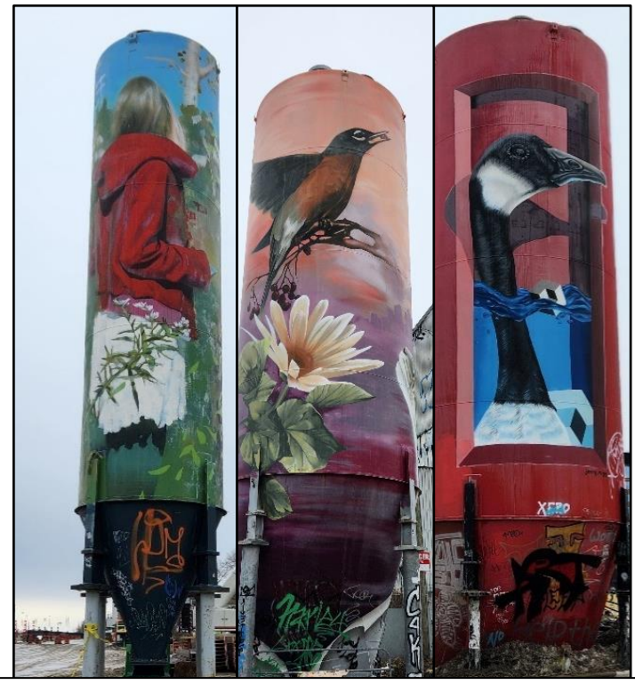
Silos to be removed at Fraser Ave (first image), Jefferson and Atlantic Ave (second image), and South Liberty Trail (third image).