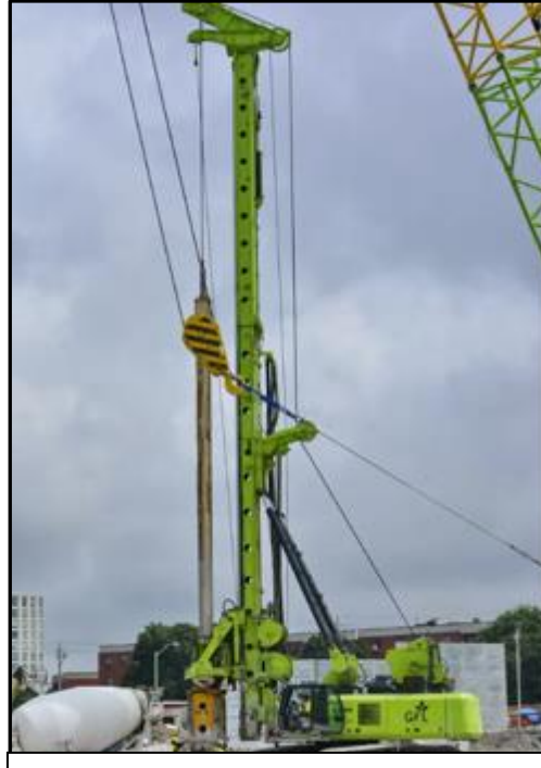
Example of a pile drilling rig