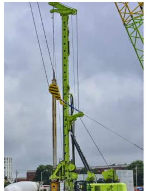
Example of a pile drilling rig